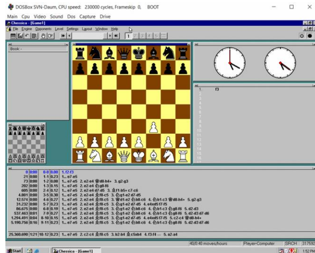
DOSBox Windows 98 Chess