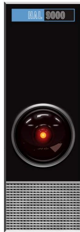
HAL 9000 from 2001 a Space Odyssey