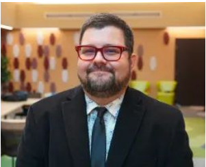
Chad Heck (unable to join us today)